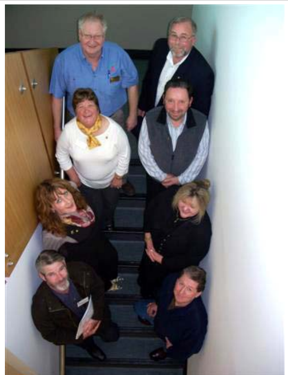
The eight new members of the Rotary Club of Moonah