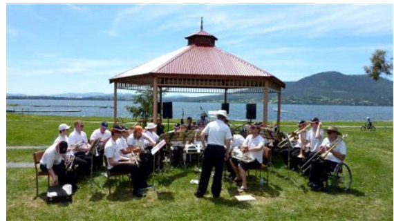
Foreshore Concert at Montrose Bay