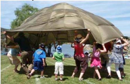
Lindisfarne Parachute Game

From Montrose Bay (organised by RC's Moonah, Glenorchy, Claremont and North Hobart)