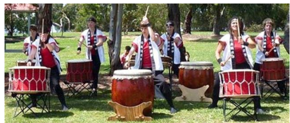
Taiko Drummers at Montrose Bay