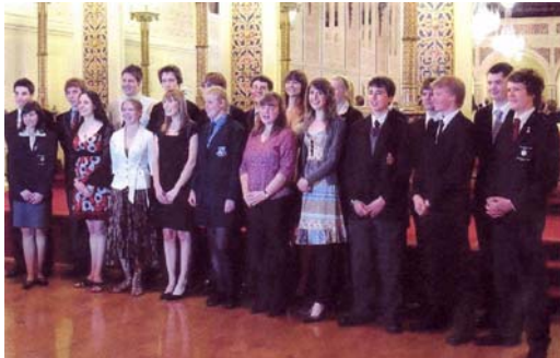
NYSF students at Government House

The students were then guests at a reception at Government House in Hobart three days later. Parents, teachers and Rotarians of sponsoring Rotary Clubs were well looked after by Government House staff whilst they admired the various public rooms of Government House.