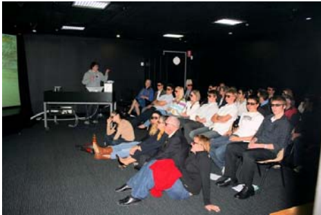
Observing a demonstration by the Human Interface Technology Laboratory

An impressive induction of the nineteen National Youth Science Forum (NYSF) students took place at the UTAS campus at Newnham recently. One of the highlights was the visit to the Human Interface Technology Laboratory.