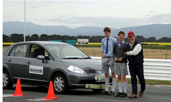
RYDA in action