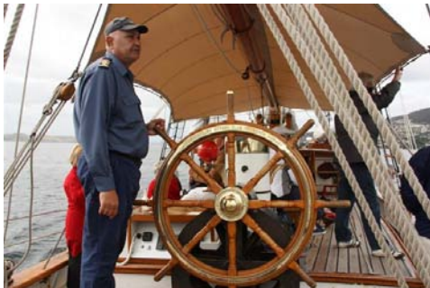
The hand crafted wheel of the Windeward Bound

The ship was launched in 1996 – it has now travelled over 50,000 nautical miles and regularly flies the flag of Rotary International. In addition it has kept to its promise of continuing to assist young people at risk, as well as others.