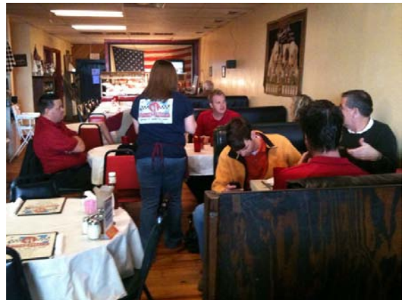
Meanwhile, somewhere in western Virginia, the Tassie GSE team doing brunch at Millie's Diner