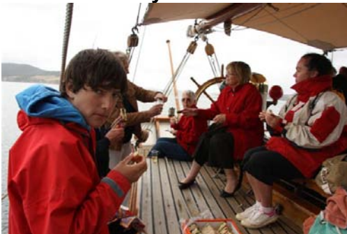
Lunch time on the Windeward Bound at Coningham