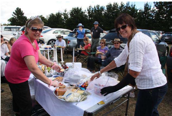
Doing it in style – RC Kingston's Silver Service lunch table at the Family of Rotary Day