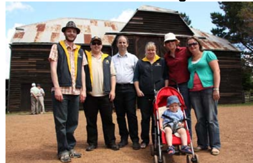
The RC City Central Hobart contingent at Brickendon

District 9830 Queensland Flood Appeal Over $500,000 raised