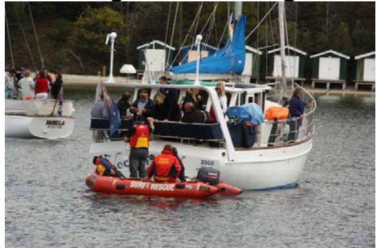
Checking all's well on board