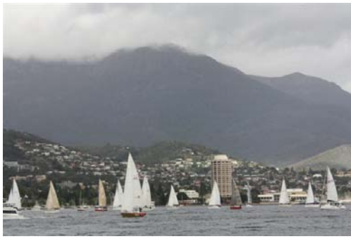
The RC Hobart Charity Sail Day flotilla heading for the D'Entrecasteaux Channel