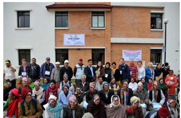
The Tasmanian delegation with patients and staff at the “Gift of Sight” Eye Camp