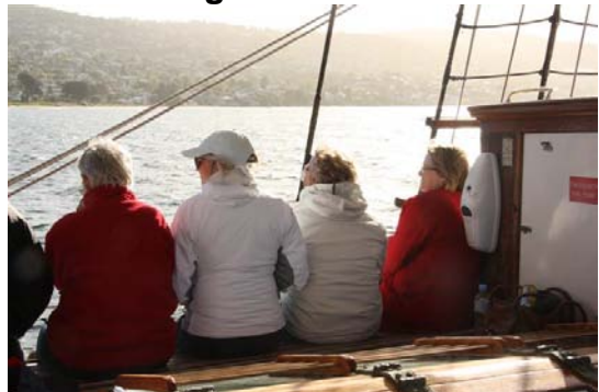
Soaking up the afternoon sun on the Windeward Bound off Sandy Bay