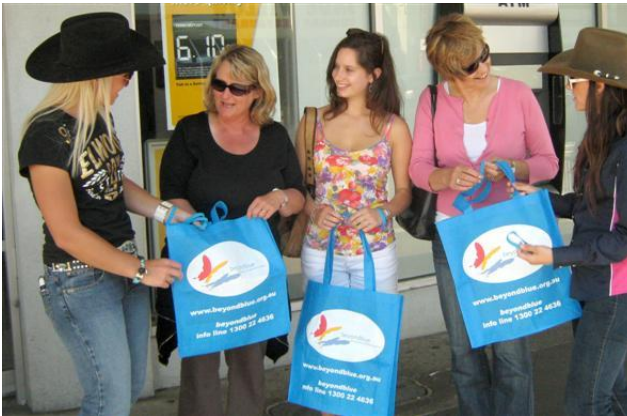
The Ulverstone Rodeo cowgirls on a Saturday morning, promoting the Ulverstone beyondblue Rodeo and helping to raise awareness of depression and anxiety in the community