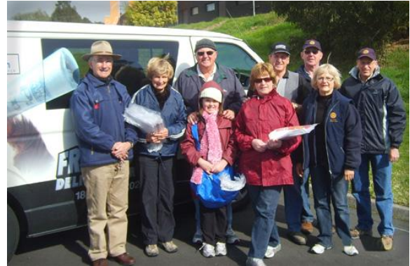
R C Bellerive's flier delivery group

RC Bellerive has found an innovative way for members to exercise and raise funds for the club at the same time. The club took on the challenge to deliver 10,000 Mercury fliers around metropolitan Hobart area over eight weeks.