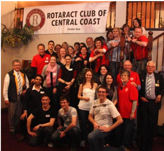
Rotaractors plus a few "ring ins" during a break at the Training Weekend.

District 9830's three Rotaract Clubs came together at Archers Manor for the District's first Training Weekend for Rotaractors. All three Rotaract clubs were well represented.