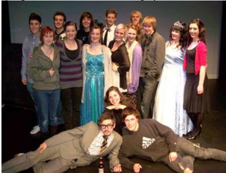
State Finalists – Storm the Stage 2010

An event such as Storm the Stage could not be put on without the help of several sponsors – Norske Skog Boyer and the Rotary Club of Hobart (Supporting Sponsors), ABC Hobart and ABC Northern Tasmania (Media Sponsors), Slick Promotions, In Graphic Design, Total Eyecare and Schweppes (In Kind Partners).