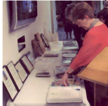
Perusing memorabilia of the RC Sorell at the 25 th Anniversary of the club.