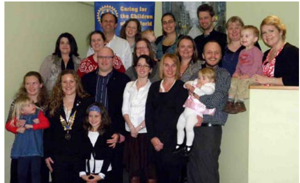
Rotababies and Rotakids and their parents at the RC City Central Hobart Changeover function

Children are welcome at the majority of City Central Hobart club meetings, and most functions and social events are tailored to be child-friendly. A special induction ceremony is held for each child, and they receive a certificate, rotary pin and hat to wear proudly at club and district events.