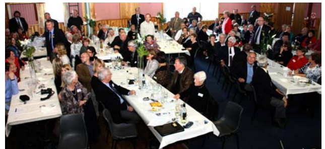
The Changeover Luncheon at the Bagdad Community Hall. The excellent turnout from around Tasmania was testimony to the strength of Rotary in Tasmania.