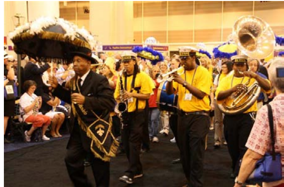
The Grand Marshall leads the Grand Parade in the House of Friendship