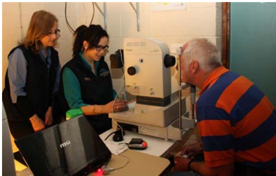
Free eye health checks offered by the Optometrists Association at the Ulverstone Health and Wellbeing Expo