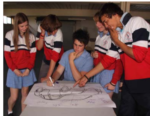
Students from Cressy District High School work out what safety features they want in a car

The visiting US teachers have now returned to Kansas City. A day at RYDA is sure to be one of the highlights of their teacher exchange.