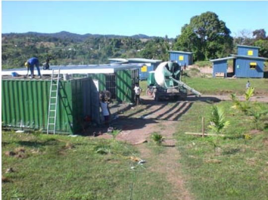
Work in progress on Koroipita Phase 2

The vision for Koroipita is for "A peaceful community where residents break free from the cycle of poverty and create a sustainable future for themselves and their children".