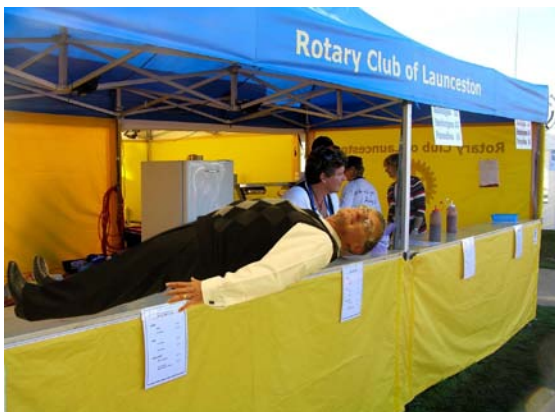
The planking craze comes to Rotary