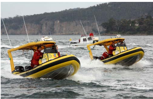
Polio 1 and Polio 2 heading up the Derwent, escorted by a welcoming flotilla